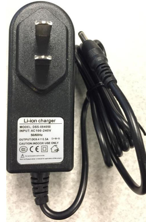
Power supply drawing and dimension